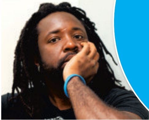
SOUTHBANK CENTRE LISTINGS PAGE 32